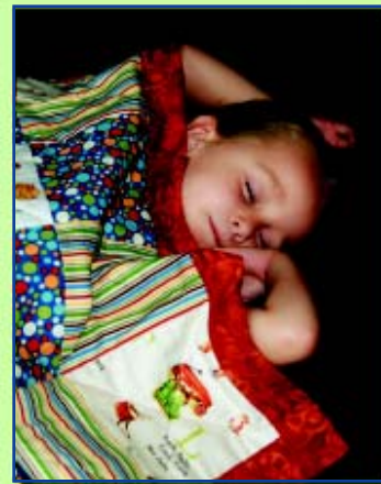
Quilts provide warmth and comfort: 90-Minute Quilt by Meryl Ann Butler.